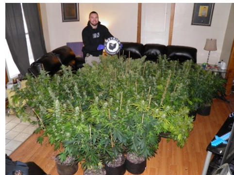
Criminal Investigation, and the Carey Police Department's K-9 unit.

Assisting with the investigation were the Wyandot County Prosecutor's Office, METRICH enforcement unit, Ohio Bureau of